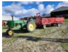
Special treat, a tractor ride of the 55-acre grounds