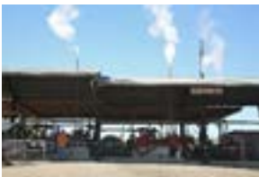
Steam Engines. Several are still working