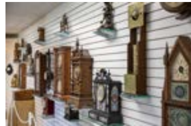
One of the country's largest collection of antique clocks