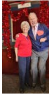
Is this the same couple? What happened to Daddy Kool??