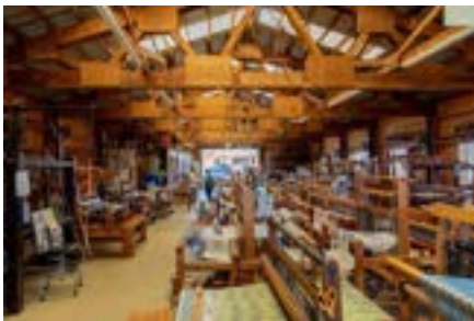
Working Textile Mill

On Saturday, April 8 we are touring the Antique Steam and Tractor Museum in Vista CA. The museum occupies 55 acres and has steam engines and tractors dating to the Late 1800's. Some of the attractions are: