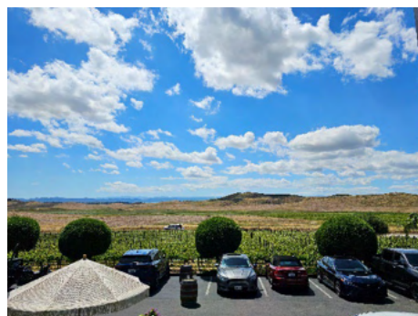
The wine country .