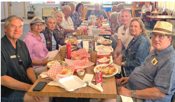
Lunch was enjoyed at the Café 54 in Potere, CA,