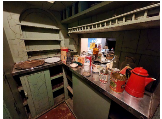
This Pullman Commandant car was built in December 1915 to accommodate the First-Class Passengers. I recall as a kid riding on the train and there were signs that "said do not flush while in the Station". That is why I never wanted to be a track man. Last photo is the pantry and kitchen where the meals were prepared.