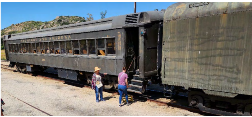
Carol Kruse-Ross, in the big hat, waits to board the train