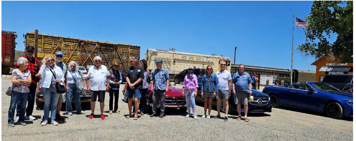
Preparing to mount up and head out for lunch.