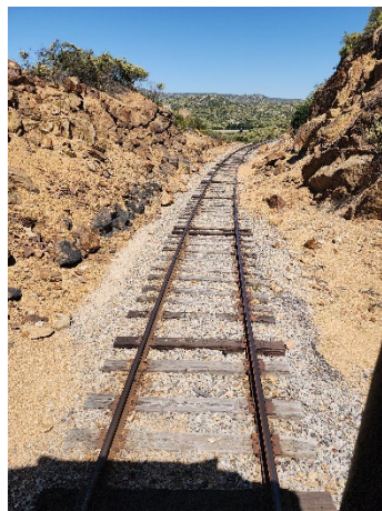
The tracks leading to Tecate, Mexico. We could see the border wall ahead.

Several years ago, the train actually went to Mexico and I was aboard one of those trips. Needless to say, it did not go smoothly.