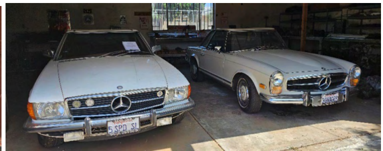
1976 280SL, R-107 Wagen, with a five-speed manual transmission. This car was never offered for sale in the U.S. Very few of this model exist in the USA. Next to it is W113 model, commonly called the Pagoda, or 280SL