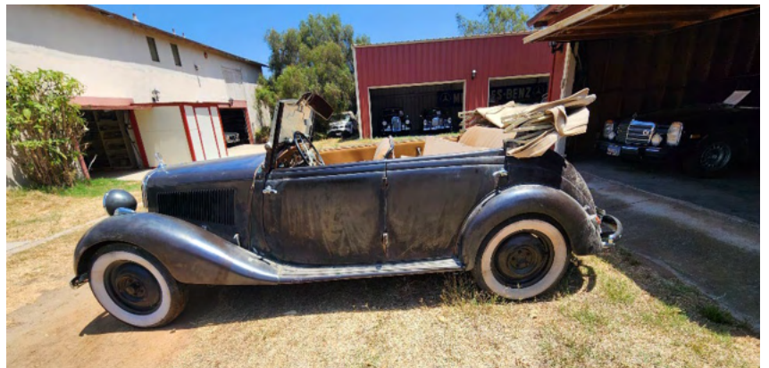
Bob's latest addition to the fleet is this 1951, 170D Cabriolet, originally delivered as a police car. Wonder if this will move to head of the line for restoration or----?