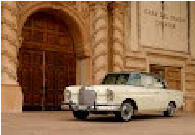
1965 220SEB, one of 6,259 produced that year, one of the few with fitted luggage, and two-tone paint. The first owner was Somoza, Dictator of Nicaragua