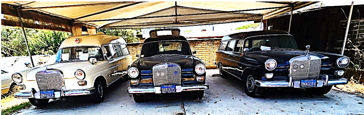
Bob's collection of special bodied vehicles, an Ambulance, a Limo and a Hearse.