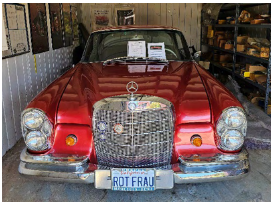
1966 220SE Coupe, AKA Rot Frau, was delivered new by the Koepke Motor Company in Lakewood, Ohio, August 12, 1966. Cost out the door was $9598.44