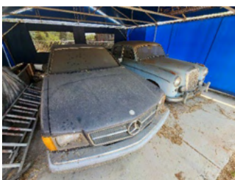
Cars awaiting attention