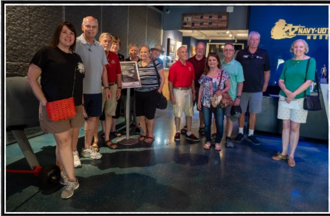
Navy Seal Museum