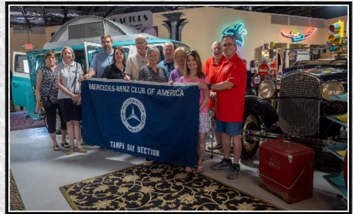
Ragtops Car Museum