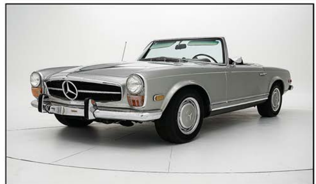
1970 MERCEDES-BENZ 280SL NOW AVAILABLE