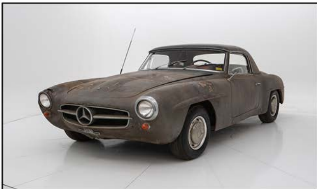
1959 MERCEDES-BENZ 190SL NOW AVAILABLE

WE BUY, SELL, RESTORE AND REPAIR CLASSIC EUROPEAN SPORTS CARS (314) 710-6600