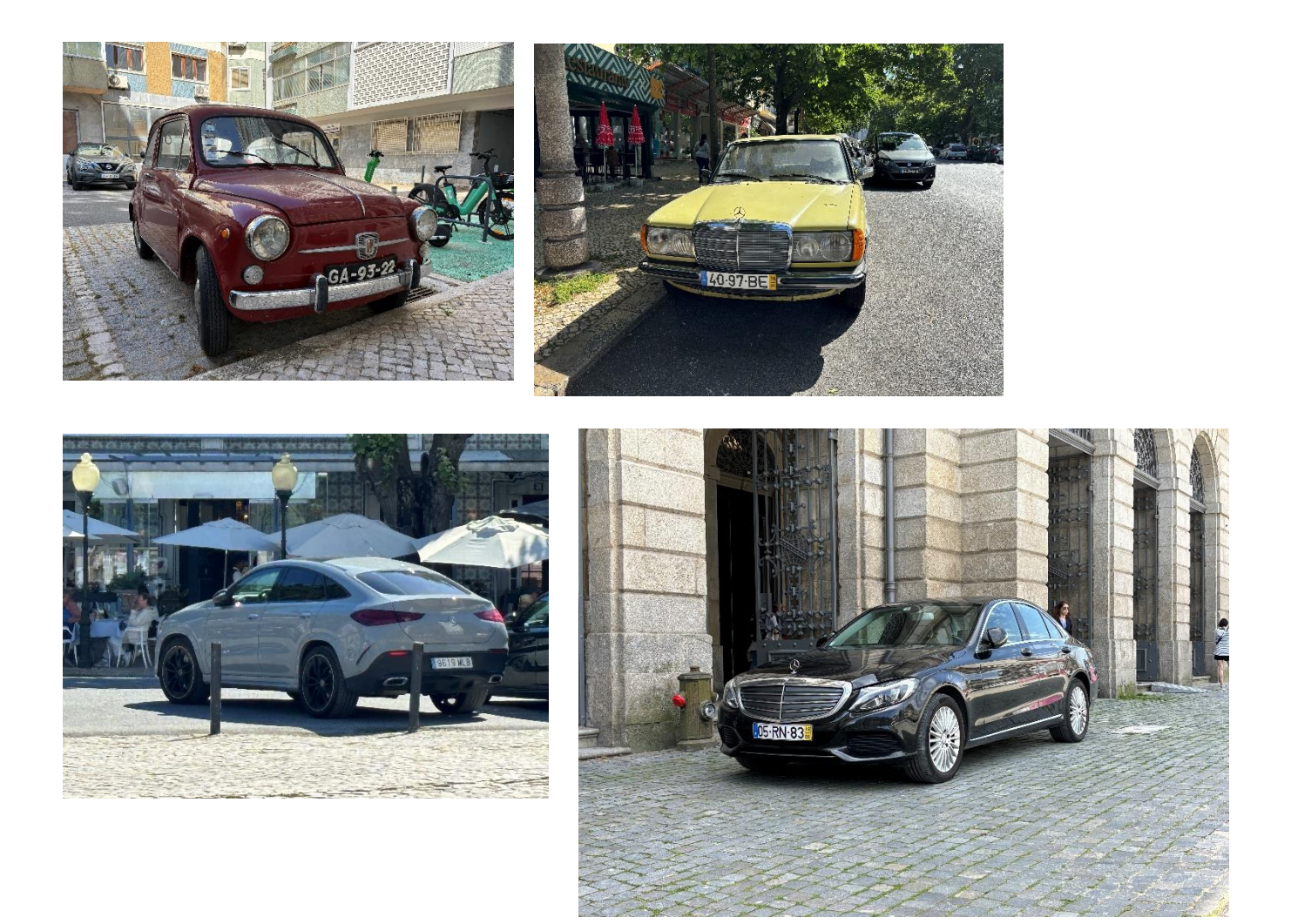
Some MB's in Portugal (and a Fiat!)

We had a wonderful time in Porto (the home of port wine), walking all over the city and spending time in cafes watching the world go by. It's a very picturesque city. One thing we did note was that all of Portugal seemed hilly. We certainly got our steps in and a good calf workout on this trip!