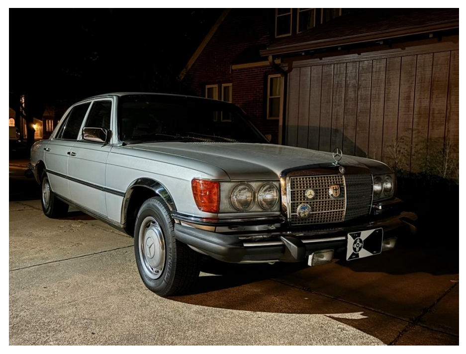
The Valkyrie is back from the shop!

Thank you all for your sustained membership and support of the club!