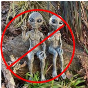
Aliens again failed to appear

iens?). Awards were given for the measurement of distance and answers to questions which were found along the route.