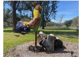
Giant Rooster Cass Winery

iens?). Awards were given for the measurement of distance and answers to questions which were found along the route.