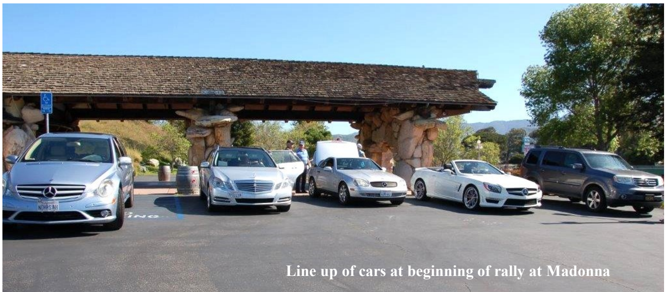
Line up of cars at beginning of rally at Madonna