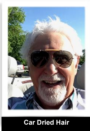
Car Dried Hair