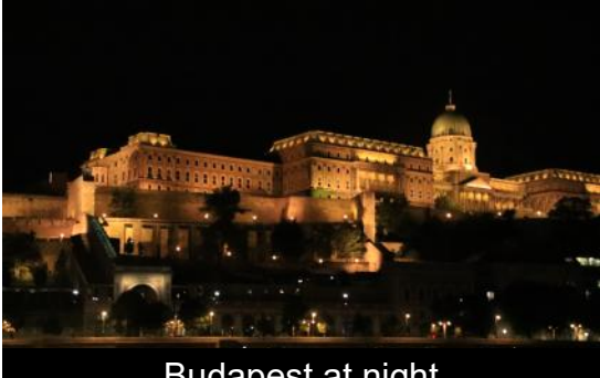
Budapest at night

destinations for us). We spent a couple of extra days in Budapest prior to starting the cruise