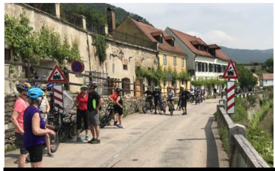
Biking along the Danube

Our stops included Vienna, Durnstein, Melk, Regensburg and Nuremberg. Side trips were offered to Salzburg,