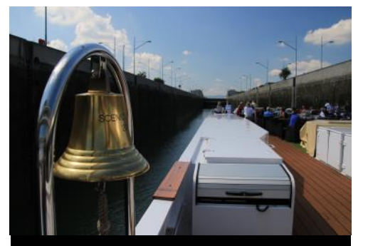
Going through a lock on the Danube

(Cont'd from previous page) -Although we are familiar with the lock travelling the river. system on the Rideau canal, it was