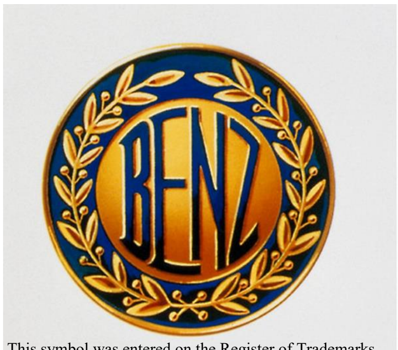
This symbol was entered on the Register of Trademarks on 10 October 1910.

It was from these beginnings that one of the world's most recognized trademarks still used to this day was developed.