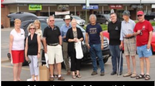
Meeting in Manotick

On May 28th the Ottawa section enjoyed a day out in Perth, Ontario. The weather cooperated and it was a beautiful spring day. Some members met in Manotick and took one hour drive to Perth in two groups. These two met up with the remainder of the 38 participants near the Old Firestation in Perth.