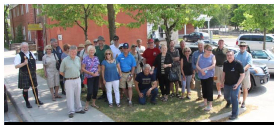
Ready for the tour of Perth

We traced some of the history of Perth through our Guide's description the town's heritage buildings. For many years Perth was the military, judicial, political and social capital of much of the Ottawa Valley.