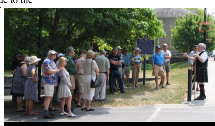
Keeping cool in Perth

provided by the Perth Tourist information office.