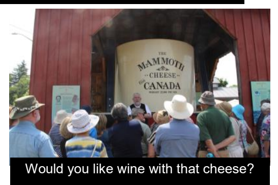
11 11 1 D 1 D 1 D

Afternoon self guided tours were aided by the information packages