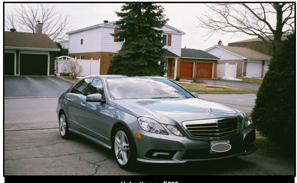
Hubert's new E550

winter wheels installed; the old ones didn't quite fit.