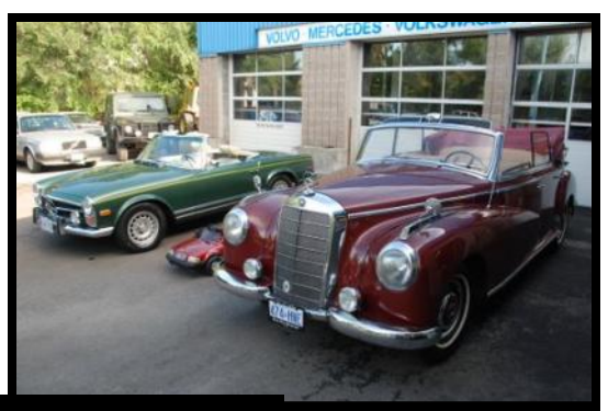
2011 Young St Garage Tech Session