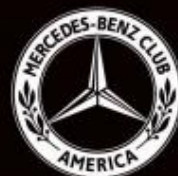
Image in contest promotional materials does not entirely represent actual prize being won.

2nd Prize 2021 Mercedes Freude Event MSRP: $6,000