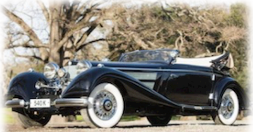
Feature Car: 1937 Mercedes Benz 540K Cabriolet