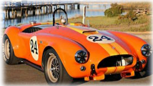
Feature Car: Shelby Cobra CSX2409