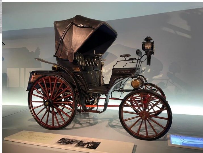
1893 Benz Vis-à-vis