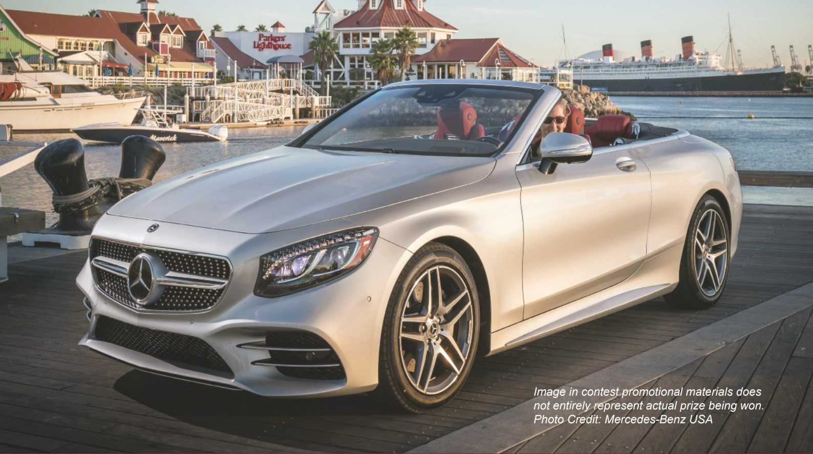
Image in contest promotional materials does not entirely represent actual prize being won.