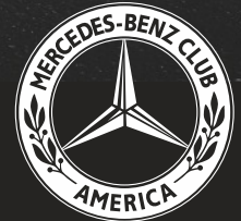
Image in contest promotional materials does not entirely represent actual prize being won.